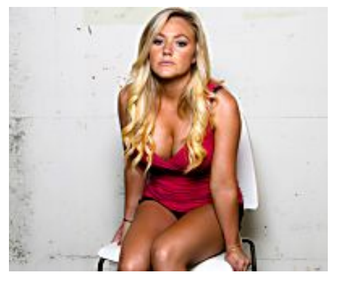
New Uncensored Search Reveals More Than Facebook Can About Your Friends TruthFinder Subscription

They Walked Who'd Been To Die...This ViralNova.com