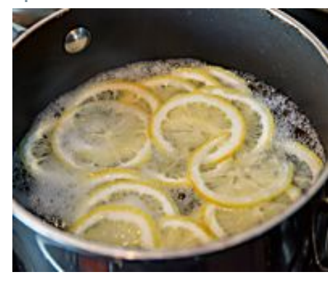
How To Fix Your Fatigue And Get More Energy Gundry MD