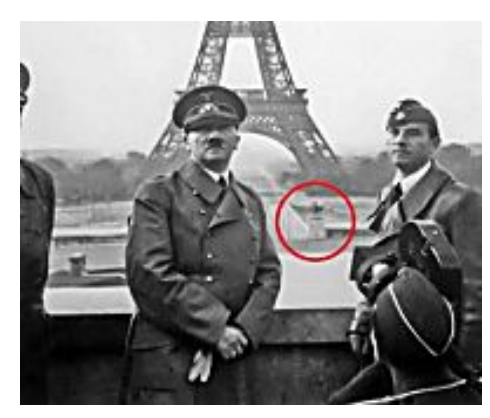
20 Completely Unsettling Historical Photos . . . . . . . . .

They Walked Who'd Been To Die...This ViralNova.com